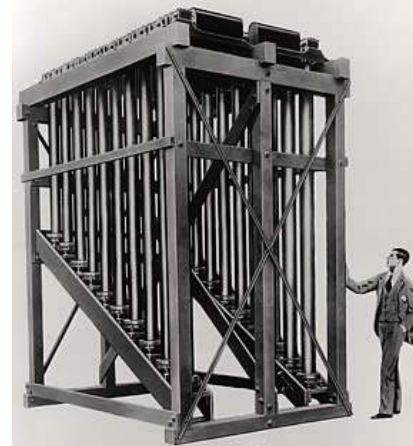
A standard 20 note Deagan Tower Chime System with dampers, circa 1927

Our July 13 road trip to Tulsa is rapidly approaching. The church and chime loft pictured here is Tulsa's First Presbyterian. The chimes are located in the octagonal portion of the tower just below the copper clad steeple. The formal publicity photo is of a twenty note Deagan Tower Chime System; no, Bill does not wear a three-piece suit when working on chimes. As you can see, there are not bells, but cylindrical chimes. The chimes