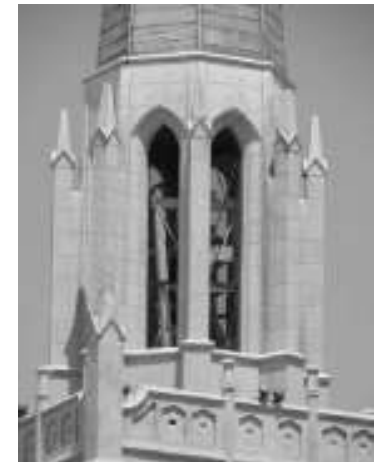
Tower of the First Presbyterian Church Tulsa, OK

are extruded brass with \frac{3}{4} " thick walls. Like all chimes, they are rung at their tops; bells are rung at their rims. The system that we are getting from First Presbyterian Church has only ten notes; its longest chime is 10'-7" and weighs about 350 pounds. The notes are very carefully chosen and can play a remarkable amount of music.