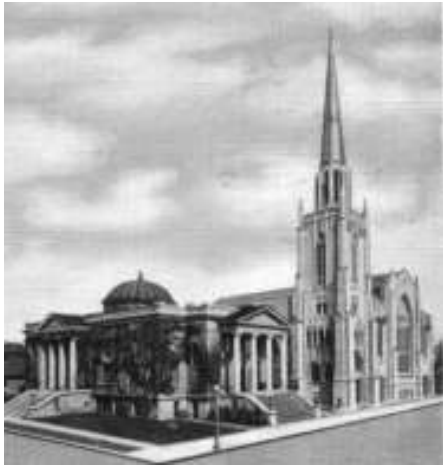
First Presbyterian Church Tulsa, OK