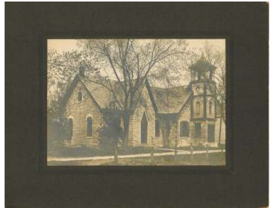
Constructed in 1858-1859, Pioneer Hall (on the right) is seen with its first addition (now incorporated into Blachly Hall) in this photo from the 1870's,