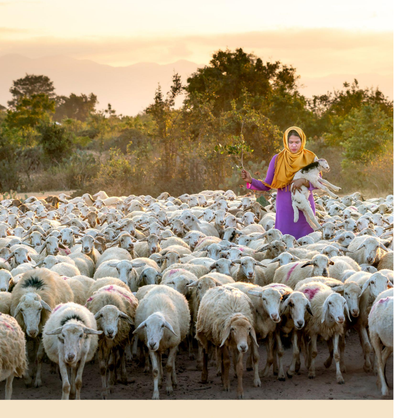
"I am the Good Shepherd. I know my sheep and my sheep know me,"